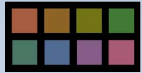
Approximation of CIE CRI Test Colors

Over the years, fluorescent phosphors have been tuned and refined to render those eight color samples well, i.e., very much like the incandescent or daylight references. But look at the “spikes” in the spectral power distribution (SPD) for the fluorescent source in Figure 1 below. If the phosphors were changed just slightly, shifting the emission wavelengths, the CRI score may drop significantly, but with little change in color rendering as perceived by the human eye. Phosphor-converted (PC) LEDs use broadband phosphors to score relatively high (70- 90+) on the CRI scale.